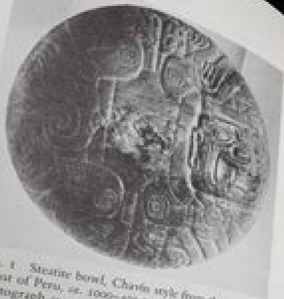
Fig. 1. Steatite bowl, Chavin style from the North Coast of Peru, ca. 1000-400 B.C. Diameter 17.8 cm.

modern thread; no doubt somebody showing off his expertise pointed out the error to the seller, or merely allowed him to see it by the way he examined the dolls.