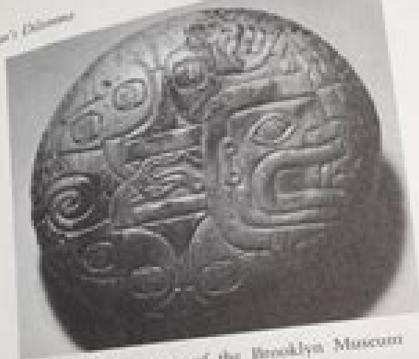
Fig. 2. Modern copy of the Brooklyn Museum bowl. Private collection.