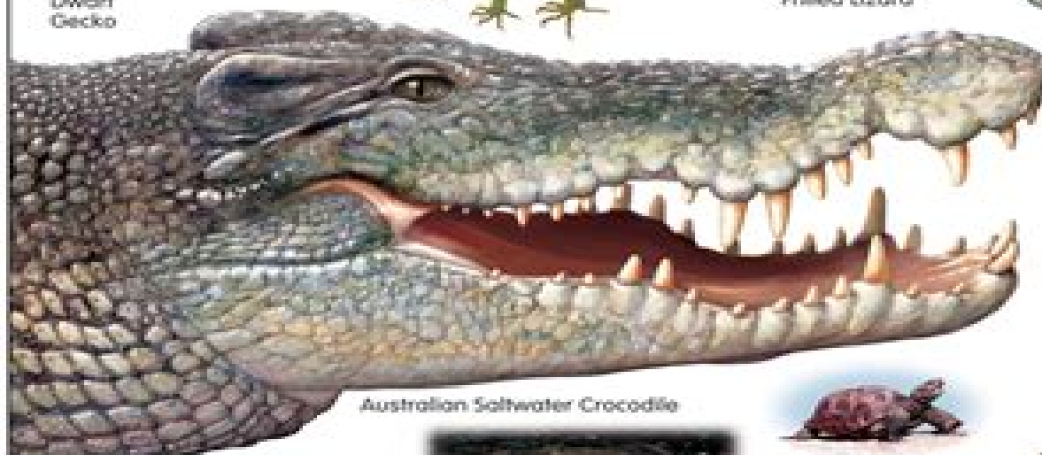
Australian Saltwater Crocodile