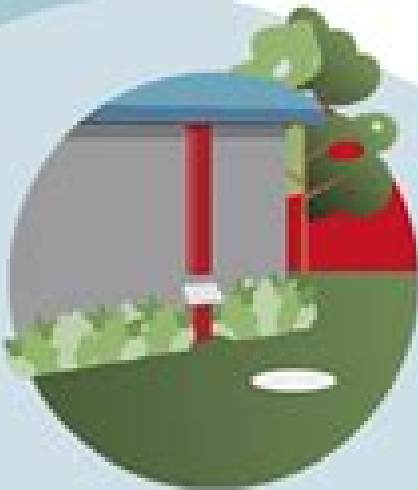
DOWNSPOUT AND BUBBLER POT