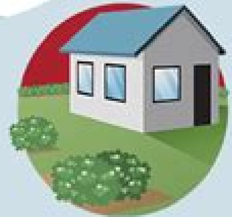
PLANT WATER-HUNGRY SHRUBS AWAY FROM HOUSE