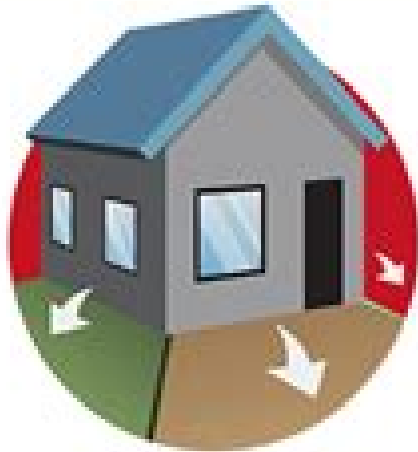
PROPERLY GRADED YARD