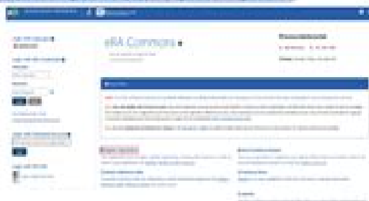
Figure 1 eRA Commons Homepage Registration Link

https://commons.era.nih.gov/commons/ol/register/ol/register.htm