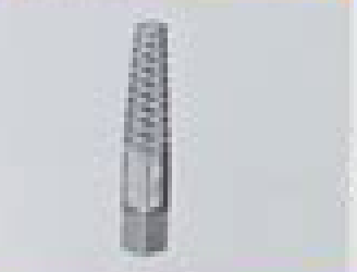
Wire Flare Tool

The wire flare tool is used to flare the ends of wires and cables. They are used to flare the ends of wires and cables. They are used to flare the ends of wires and cables. They are used to flare the ends of wires and cables.