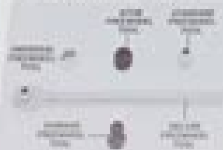
Flareless and Flareless Flare Tools

The flareless and flareless flare tools are used to flare the ends of wires and cables. They are used to flare the ends of wires and cables. They are used to flare the ends of wires and cables. They are used to flare the ends of wires and cables.