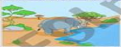
AFRICAN SAVANNA BIOME