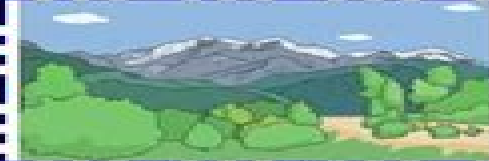
MOUNTAIN RANGE WITH SNOW