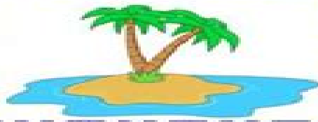
ISLAND WITH TREE