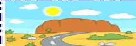
ULURU DESER BIOME