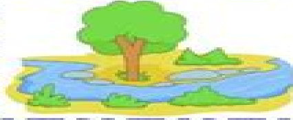
FLOWING RIVER AND TREE