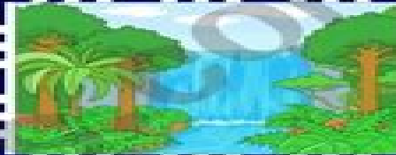
RAINFOREST BIOME WITH TREES AND WATERFALL