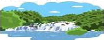
RIVER WITH WATERFALL