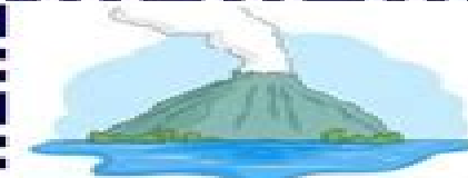
VOLCANO ON AN ISLAND