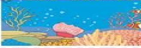
CORAL REEF BIOME