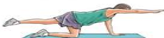
Quadruped arm/leg raise