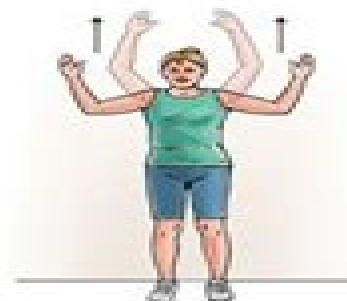
Arm slide on wall