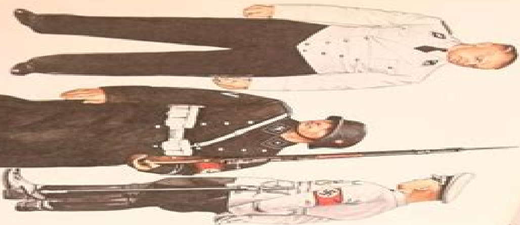
46. SS Men (Tunic)