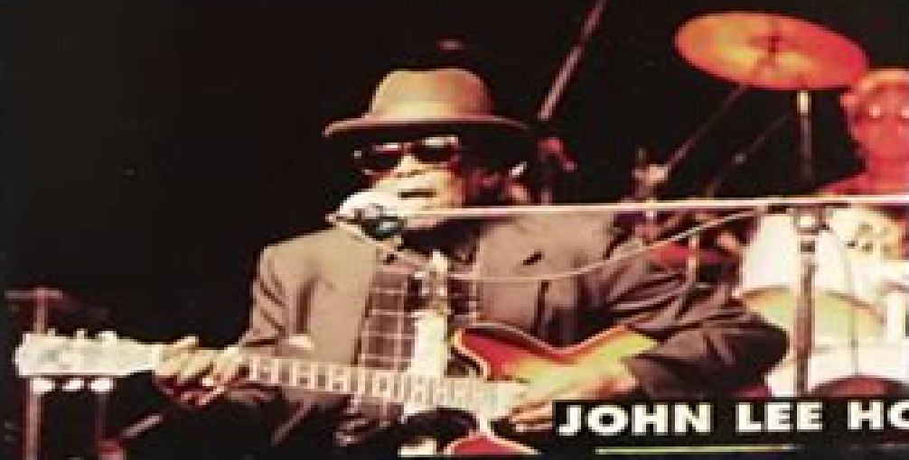
JOHN LEE HOOKER