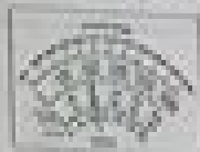
Purge Hose from Air Cleaner