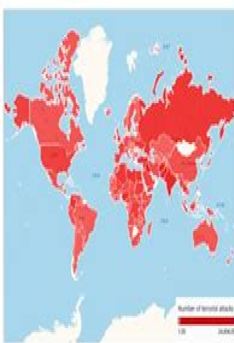
(a) The map of all countries which attacked the terrorist attacks