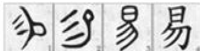
FIGURE 2.1 Yi in different Chinese scripts. 1. Shang dynasty oracle bone script. 2. Zhou dynasty bronze inscription. 3. Seal script. 4. Regular script.

Yi (易) holds multiple layers of meaning. It means “to change” or “interchange,” which is to cause a turn of events in succession, and it also means “to venture” and “to reveal,” “to exchange hands from one to the other.” “Change” in the context of this book holds a dual nature: it denotes the changes that take place in the natural course of events, and it simultaneously denotes the changes that will now go into effect as a direct result of having divined on the matter. The yi signifies an exchange. The Oracle is as much a book of exchanges as it is a book of change.