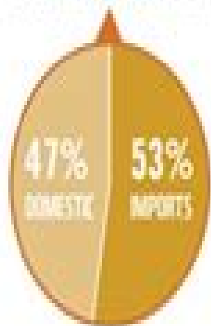
EU ENERGY SUPPLY