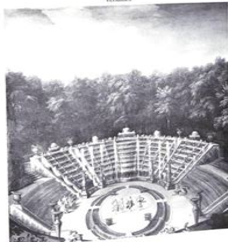
Plate 17. Versailles, Suite de Bell, showing the Grand Fontaine