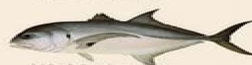
Jack Crevalle ( Caranx hippos )