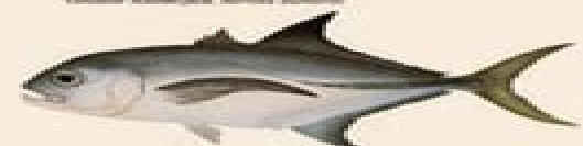
Horse Eye Jack ( Centropomus labrus )