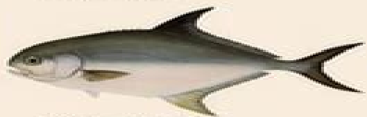
Florida Pompano ( Thalassoma bifasciatum )