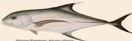
Florida Pompano ( Thalassoma bifasciatum )