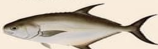
Pompano ( Thalassoma bifasciatum )