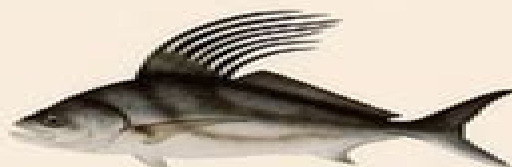
Bonefish ( Albula vulpes )