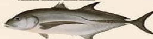
Horse Eye Jack ( Centropomus labrus )