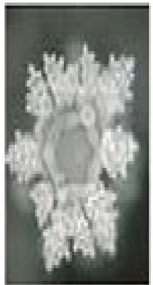
Shown a photo of a lotus