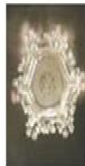
Shown a photo of dolphins