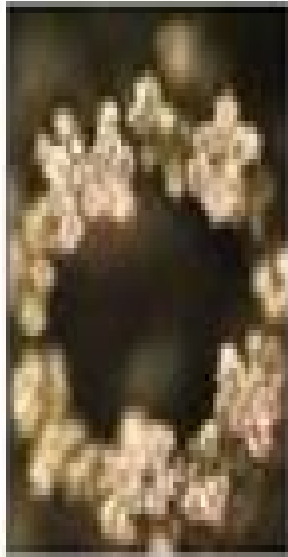
The word Angel