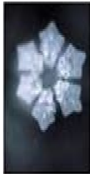
Imagine by John Lennon