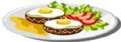
BEEFSTEAK WITH EGG