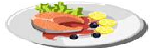
SALMON WITH LEMON