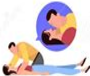
CHECK VITAL SIGNS