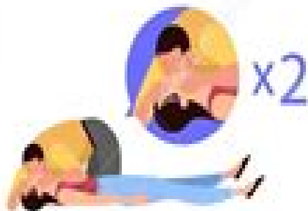
GIVE RESCUE BREATHS