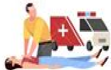
WAIT FOR HELP