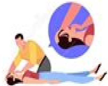
LIFT CHIN CHECK BREATHING