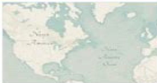
Modern Antique Map