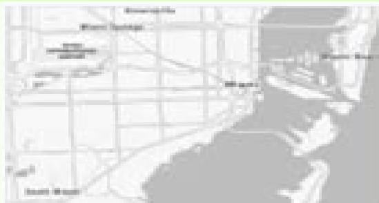
Human Geography Map