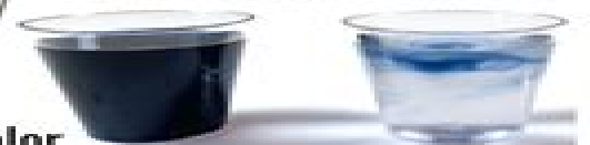
Iodine Clock Reaction