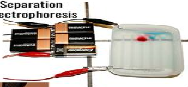
Pigment Molecules in Bacteria