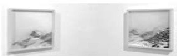
Lola Bunting Only Waning Days, 2020 [Two part work] - Giclee prints, custom frames with frosted glass Edition of 3 + 1 AP (each hand finished glass)