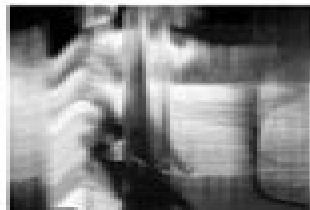
James Hoff Skywiper No. 94 2016 Chromaluxe transfer on Aluminum 50.8 x 40.6 cm