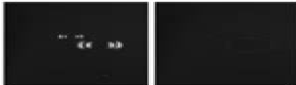
Chris Cornish Out of the Black, Into the Blue 2012 Diptych c-type photograph 40 x 27 cm