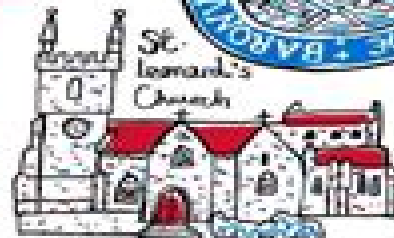
St. Leonard's Church