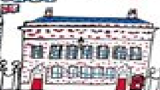
High Street - Independent Shops