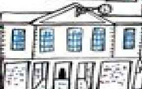
Hythe Town Hall