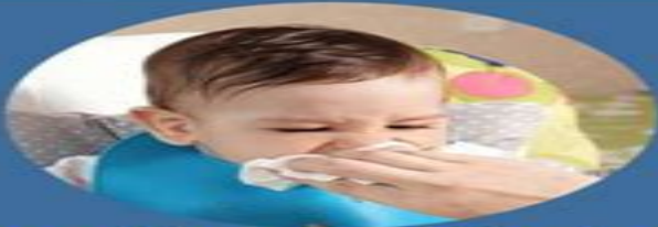
Vomiting and diarrhea