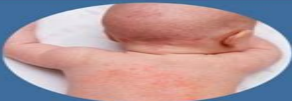
Rashes and hives on the skin