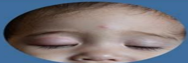
Swollen lips, nose, tongues, and eyelids