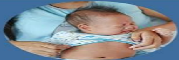
Abdominal pain and discomfort