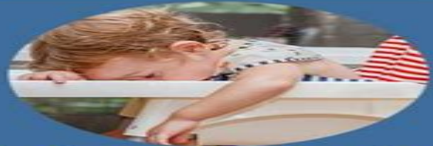
Tiredness and fussiness