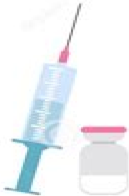
Birth control injections