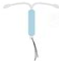
Hormonal intrauterine device