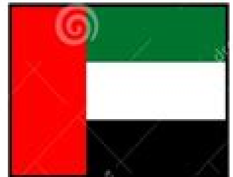
United Arab Emirates