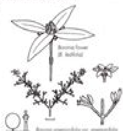
Boronia Smithii var. Smithii