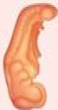
Foetus (3 weeks)