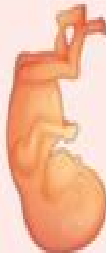
Foetus (20 weeks)