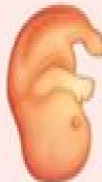
Foetus (10 weeks)