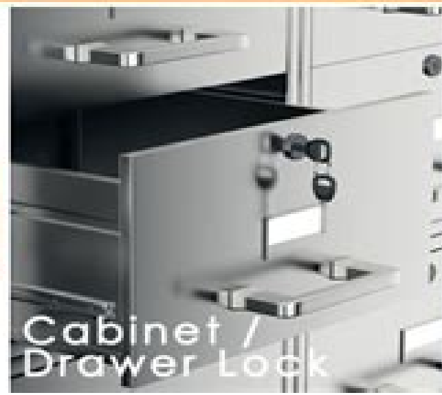
Cabinet / Drawer Lock