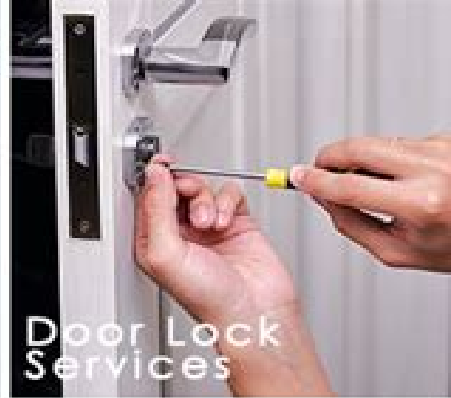
Door Lock Services