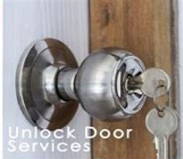
Unlock Door Services