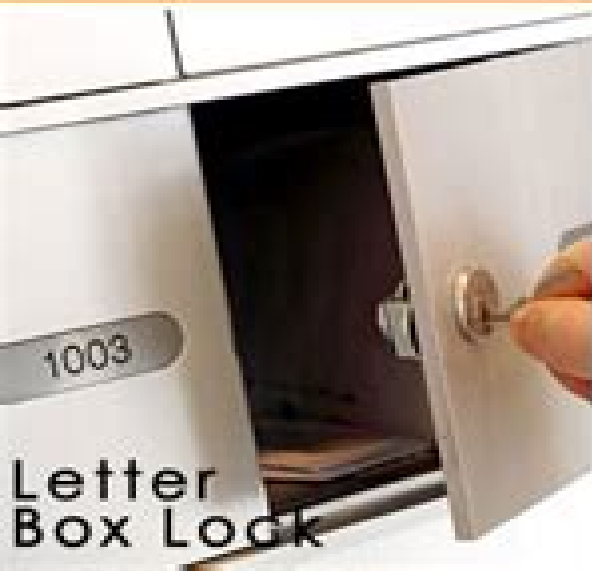
Letter Box Lock