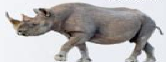
West African Black Rhinoceros