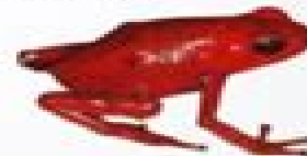
Splendid Poison Frog