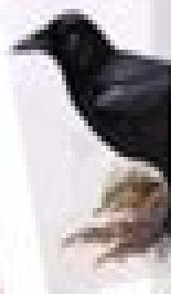
LE C le c le