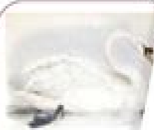
LE CYGNE le cygne le cygne