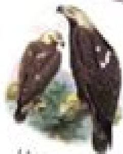
L'AIGLE l'aigle l'aigle