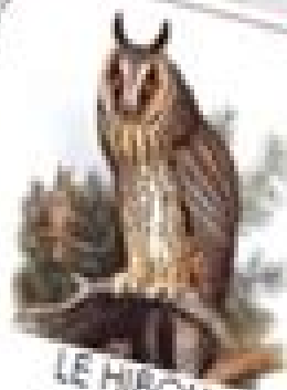
LE HIBOU le hibou le hibou