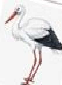
LA CIGOGNE la cigogne la cigogne