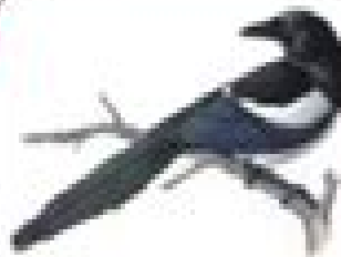
LA PIE la pie la pie