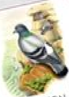
LE PIGEON le pigeon le pigeon