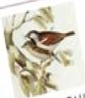
LE MOINEAU le moineau le moineau