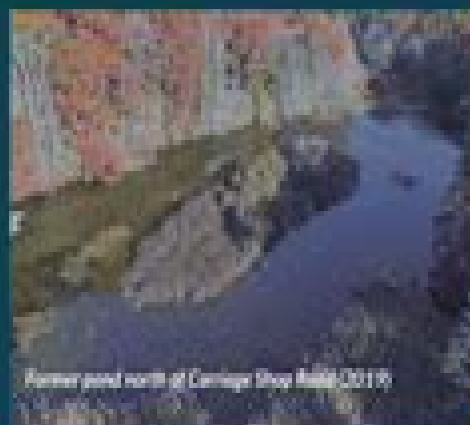
Former pond north of Carriage Shop Road (2019)