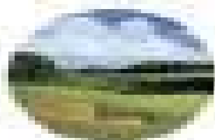
Bethpage Black #7 1984-85