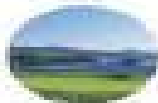
Bethpage Black #15 1984-85