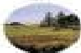
Bethpage Black #16 1984-85