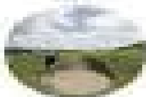
Bethpage Black #13 1984-85