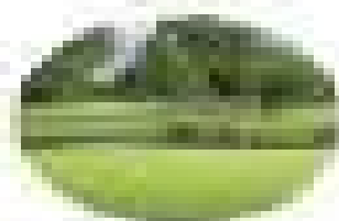
Bethpage Black #10 1984-85