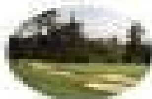
Bethpage Black #20 1984-85