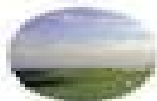
Bethpage Black #6 1984-85