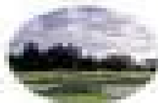
Bethpage Black #19 1984-85