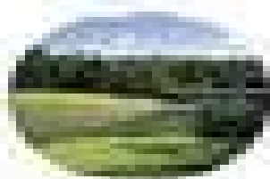
Bethpage Black #8 1984-85