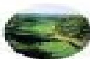
Bethpage Black #4 1984-85