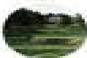
Bethpage Black #18 1984-85