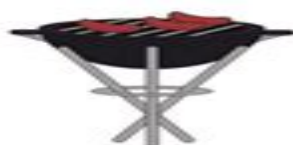
Bachelor griller grill