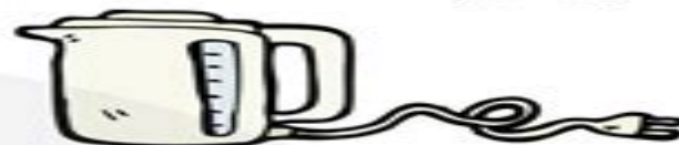
electric kettle hot pot