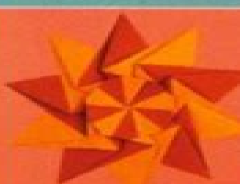
COMBINACIONES DE COLORES