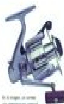
En la pesca con pez muerto se utiliza la caña.

La pesca con pez muerto en agua dulce es una técnica que se utiliza en la pesca con pez vivo. La caña debe ser lo suficientemente rígida para poder hacer un efecto de vida. Por lo tanto, la caña debe ser lo suficientemente rígida para poder hacer un efecto de vida. Por lo tanto, la caña debe ser lo suficientemente rígida para poder hacer un efecto de vida.