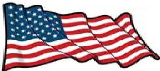
1) Current US Flag