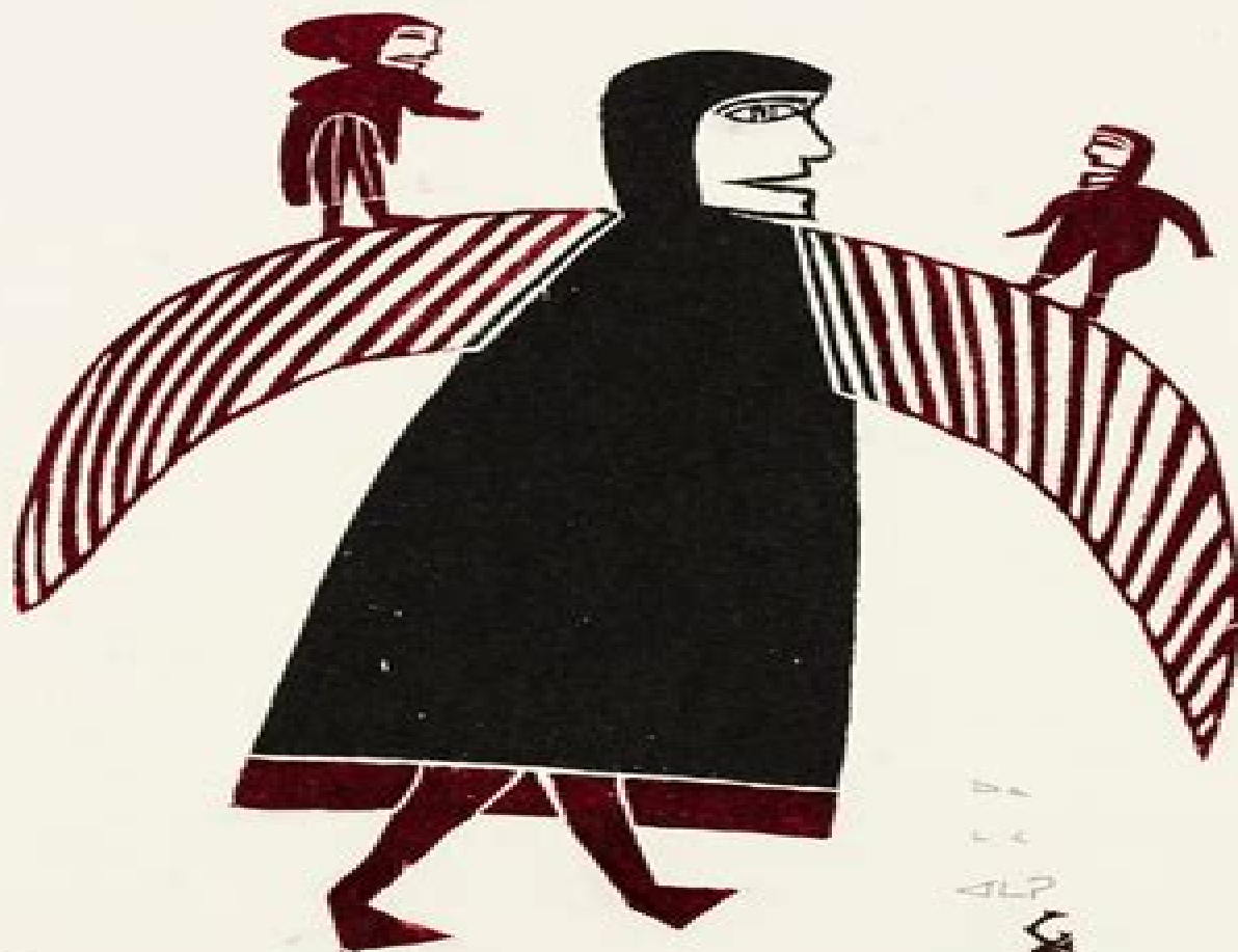
Dream of the Bird Woman Yes Stone Cut 1969 III Conch, Malaga, Amavook