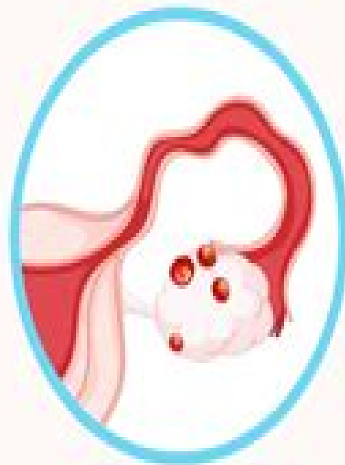
Early stage of ovarian