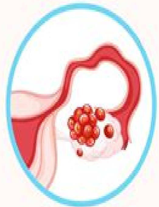
Metastatic stage of ovarian cancer