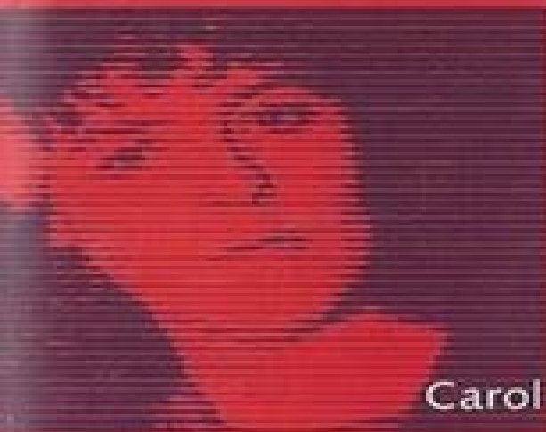
Carol Ann Duffy

Poetry in Performance: 10 poets and 2 musicians