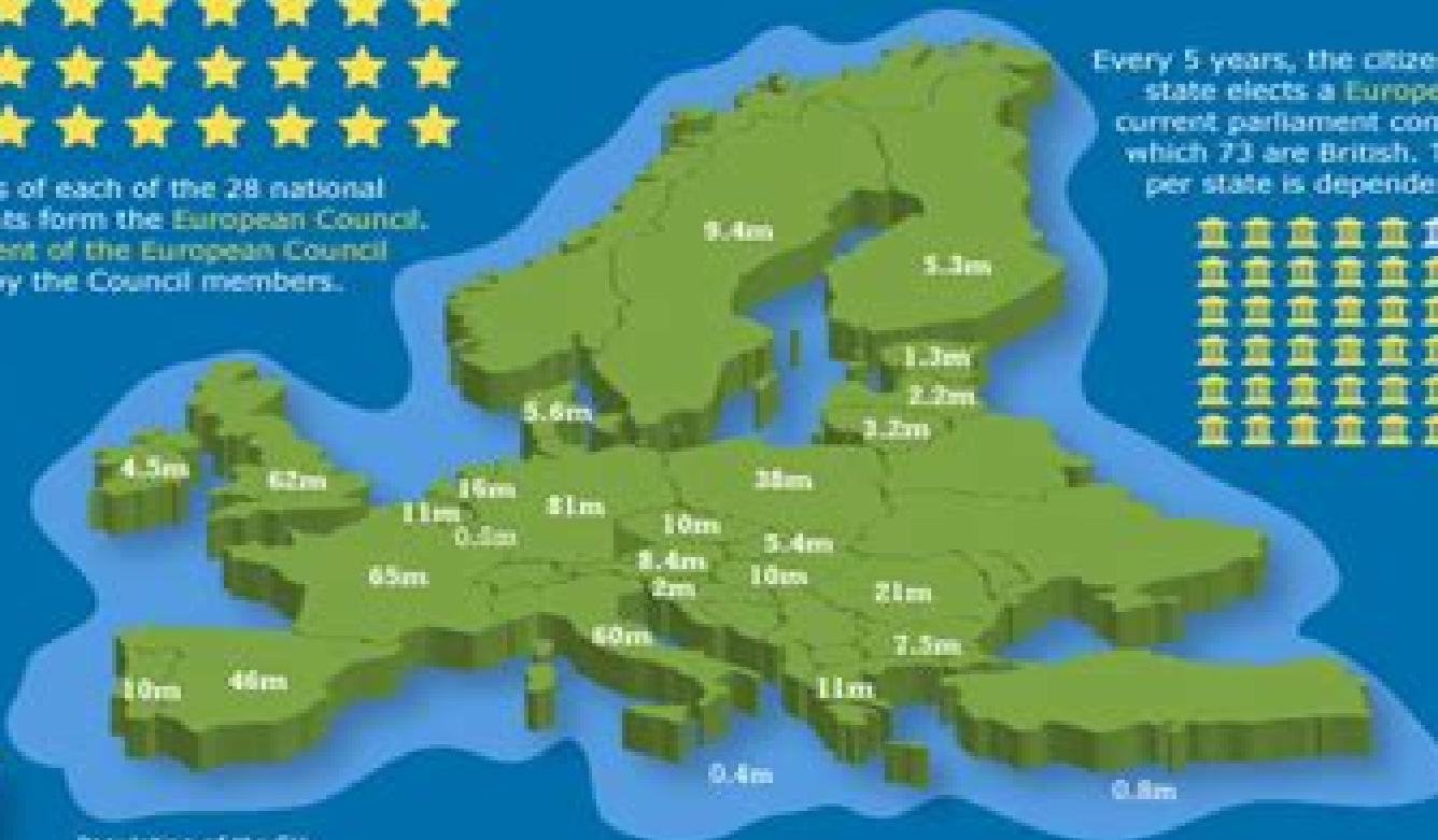
Population of the EU

The Council nominate a President of the Commission, this can be the same person as the President of the Council. The nominee must also be approved by Parliament. The President and the Council then appoint a commissioner from each of the other 27 states to form the European Union's executive body, the European Commission.