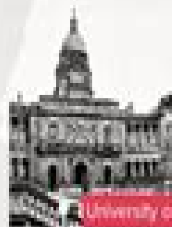
University of Edinburgh