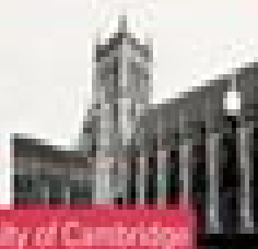
University of Cambridge