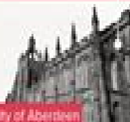
University of Aberdeen