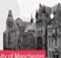
University of Manchester