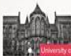
University of Glasgow