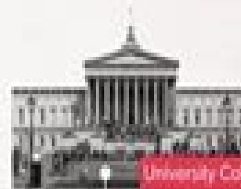
University College London