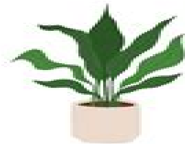
CAST IRON PLANT