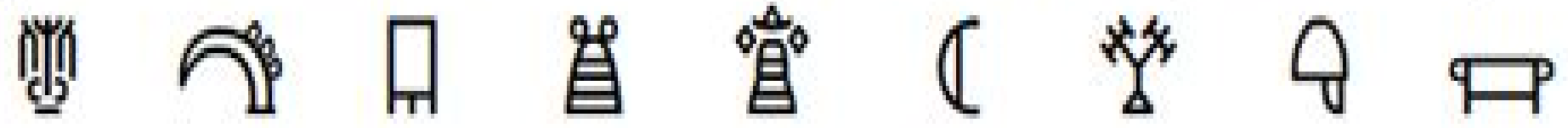
wool horn cloth garment armour month tree helmet footstool