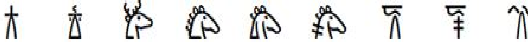
man woman deer horse mare stallion sheep ram she-goat