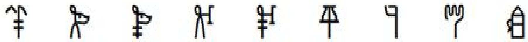
he-goat pig sow cow bull wheat barley olives condiment