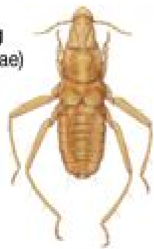
bat bug (Polyctenidae)