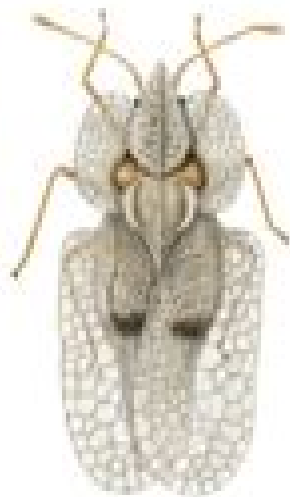
lace bug (Tingidae)