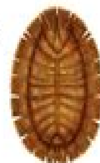
termite bug (Termitaphididae)