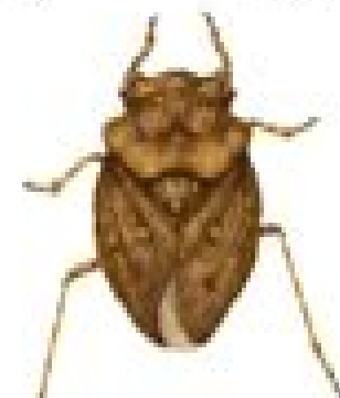
toad bug (Gelastocoridae)