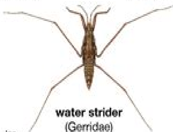
water strider (Gerridae)