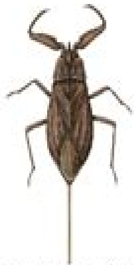
water scorpion (Nepidae)