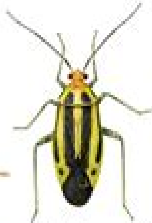
plant bug (Miridae)