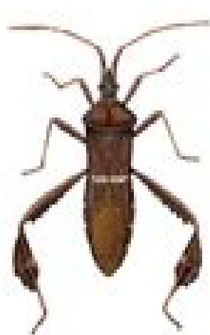
coreid bug (Coreidae)