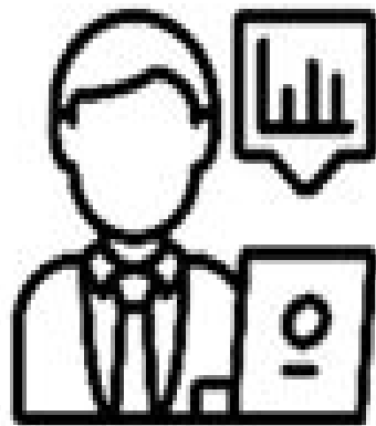
Fixed Income Analyst or Manager