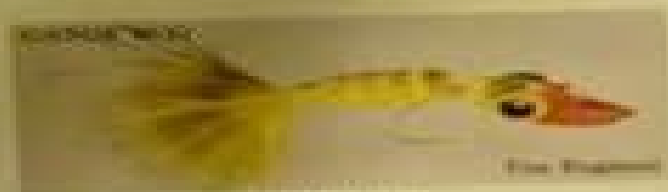
YELLOW TROUT FLY