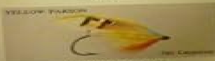
YELLOW TROUT FLY