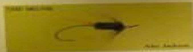
BLACK TROUT FLY