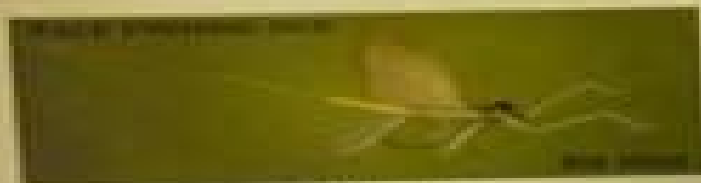
GREEN TROUT FLY