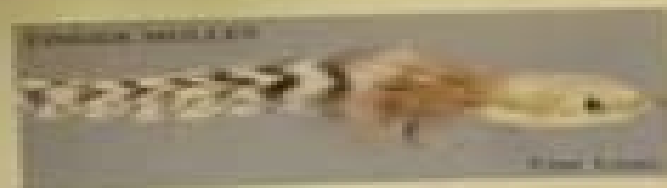
WHITE TROUT FLY