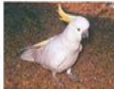
Yellow-crowned Night Heron: Large, white bird, common in coastal to inland areas.