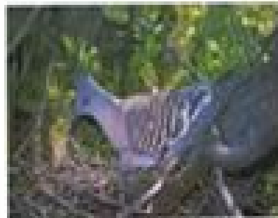
Common Moorhen: Found in coastal to inland areas in southern to central.