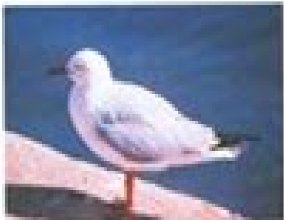
White Egret: Not common but increasing along shallow water in coastal to large ponds.