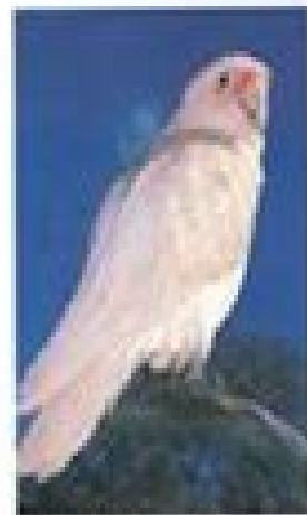
White: Found in coastal to inland areas in southern to central.