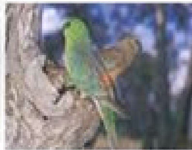
Green: Found in coastal to inland areas in southern to central.