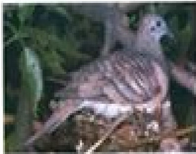
Ring-billed Gull: Common in coastal to inland areas in southern to central.