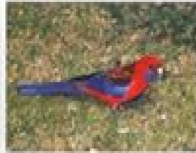
Common Moorhen: Found in coastal to inland areas in southern to central.