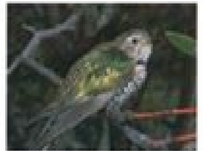
Green: Found in coastal to inland areas in southern to central.