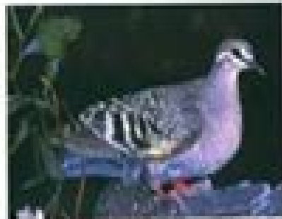
Common Moorhen: Found in coastal to inland areas in southern to central.