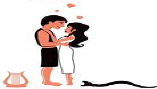
ORPHEUS AND EURYDICE