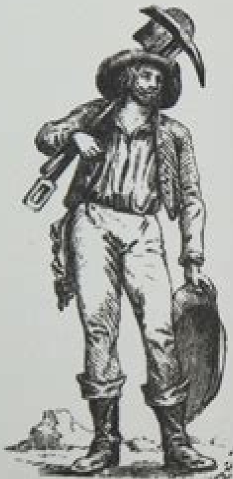
A California Goldseeker