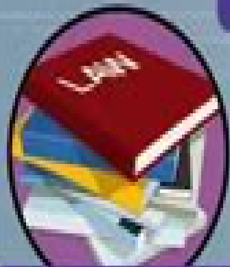
National and Local Laws