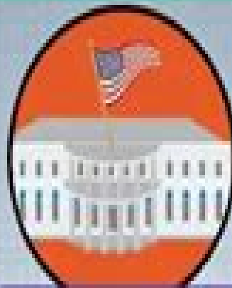
The White House